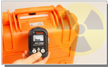
RadEye SPRD Personal Dosimeter

RadEye PRD RadEye B-20 RIIDEye RadEye SPRD TPM-903B Portal Monitor