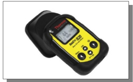
RadEye B-20 Multi-Purpose Survey Meter