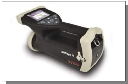
Riideye Radioisotope Identifier

Owens Scientific, Inc. 23230 Sandsage Ln. Katy, TX 77494 281-394-2311 Main 281-394-2522 Fax OwensScientific.com Small Business, Woman Owned HUB Certified, State of Texas