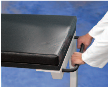
Convenient handles for easy movement and positioning.