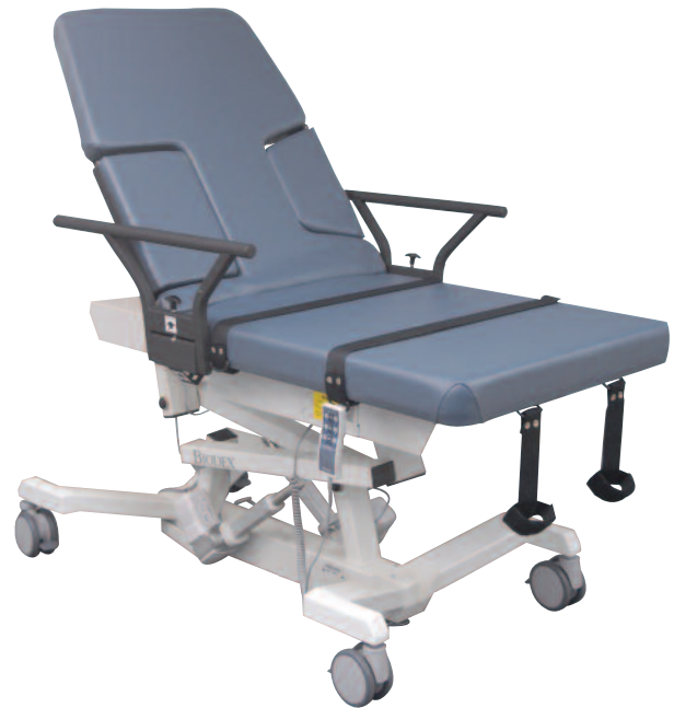
Fowler back motor controlled with infinite adjustment through 80°.

Similar to the Echo Pro with feature and function, the Econo Echocardiography Table is offered without Trendelenburg positions or central locking casters to deliver a lower cost alternative. There are no barriers between sonographer and patient on the Econo Echocardiography Table, allowing correct scanning posture to prevent musculoskeletal injury. The cardiac scanning cutout provides open access to the patient's left thorax area for an unobstructed apical approach. The motorized Fowler back is infinitely adjustable to 80°.