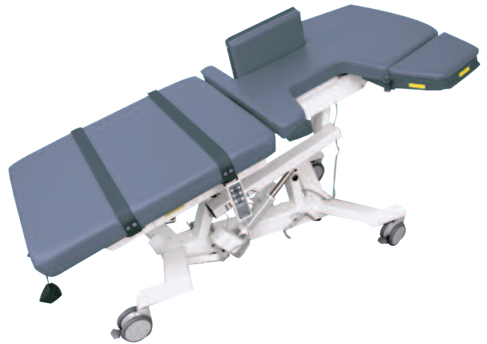
Cardiac Scanning Cutout with pivoting cushion doubles as an armrest. Adjustable Sonographer Cutout drops down or folds up for maximum patient access.

There are no barriers between sonographer and patient on the Echo Pro table, allowing correct scanning posture to prevent musculoskeletal injury. The cardiac scanning cutout provides open access to the patient's left thorax area for an unobstructed apical approach. The motorized Fowler back is infinitely adjustable to 80° via hand or foot controller.