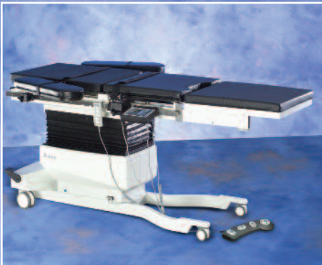
Radiolucent extension converts the Brachytherapy Table into a general purpose C-Arm Table.