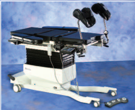
Compact and smooth rolling design makes the Brachytherapy Table ideal for swing room use.