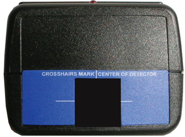
The end panel of the MC1K Shown